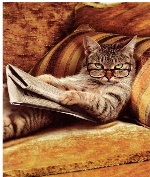
Where are my slippers?