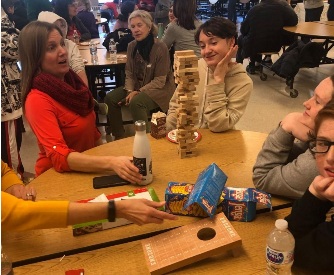
Mentors and their mentees celebrate the TEAM Tuskers Mentoring Program with games and snacks.

If you are interested in having a positive impact on a child's life, there are many ways to volunteer in Somers schools. The TEAM Tuskers mentoring program matches adults with students to meet one-on-one for an hour every week during the school year.